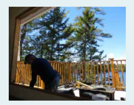
Steve Hudson prepping headquarters building for window replacement.

Infrastructure maintenance is not a glamorous part of Sanctuary work but is fundamental to our operations. Our next big project on this front is septic system replacement for the HQ building to ensure proper facilities for visiting school groups, public events, and water quality protection. We have multiple estimates for this work suggesting it will be in the ballpark of $15,000. Help towards tackling this bigger cost project, and, of course, all of our operations is greatly appreciated!