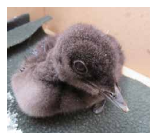
Round Pond loon chick.

Our loon observation network helped make this possible in part - by knowing what is going on with the MDI loon pairs, the number of chicks, places they frequent. We cannot have too many observations of any of these family groups and the birds